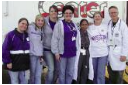
Left photo: Members from the Cincinnati Veterans Administration Medical Center. Right photo: Staff of Goodwill's Special Projects Office