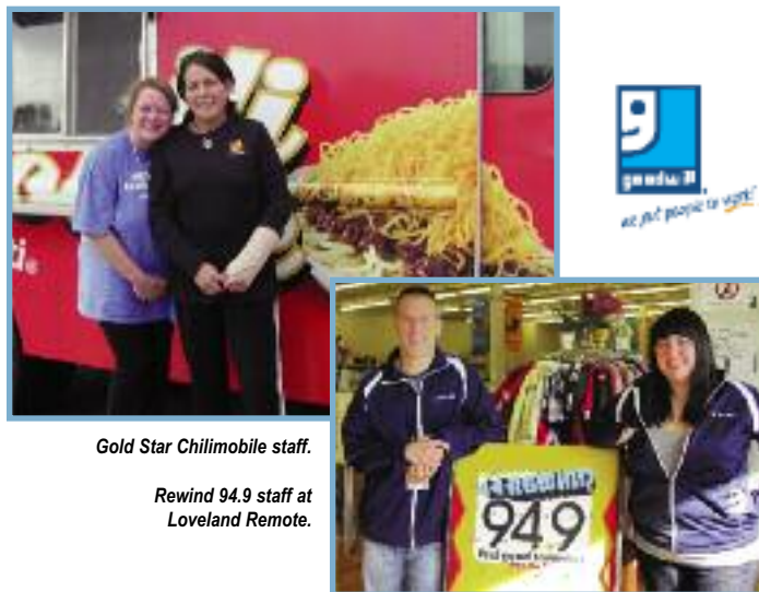
Gold Star Chilimobile staff.

Partnering with Gold Star not only helps to bring in much needed clothing donations at this critical time of the year, but it also helps to raise awareness of Goodwill's very important mission. Goodwill salutes the Gold Star Chili organization and its many locations for their help and assistance to make the public more aware of how donations assist Goodwill with its mission to help put people to work!