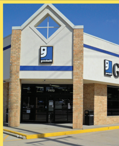
Top Photo: New Oxford Retail Store and Drive-up Attended Donation Center. Bottom Photo: New West Chester Retail Store and Drive-up Attended Donation Center