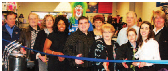
Friends from Mt. Washington Business Association and Goodwill staff cut ribbon opening Mt. Washington Boutique!