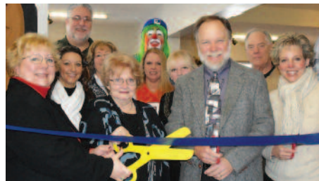
Friends from City of Montgomery and Goodwill staff cut ribbon opening Montgomery Boutique!