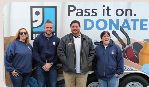
Goodwill Donations Team at IKEA donation event.

On Sunday, April 23rd, Goodwill held its 4th Annual Electronics Recycling Celebration event at all 33 of its Greater Cincinnati donation locations in partnership with electronics recycling vendor, Cohen Electronics Recycling. As in past Earth Day recycling donation events, community members took advantage of the opportunity to recycle their outdated electronic equipment in a responsible way by choosing to donate to Goodwill. While the organization accepts donations of electronic equipment every day at all of its locations, the Earth Day weekend celebration event is held just to bring