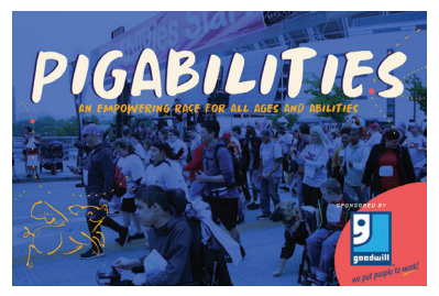
May 2, 2020 at 1:00 pm

The excitement is already starting to build as Ohio Valley Goodwill begins planning for the 2020 PigAbilities event as part of the Flying Pig Marathon. As the Title sponsor for the PigAbilities event. Goodwill is pleased to be part of this year's celebration of the annual Flying Pig Marathon. PigAbilities is an empowering option for athletes of all ages and abilities who want to commit to going the distance by making healthy choices in their lives.