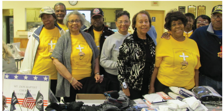
Volunteers from Mt. Zion Baptist Church – Woodlawn, OH