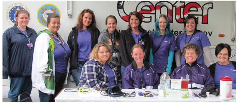
Team members from the Cincinnati Veterans Administration Medical Center