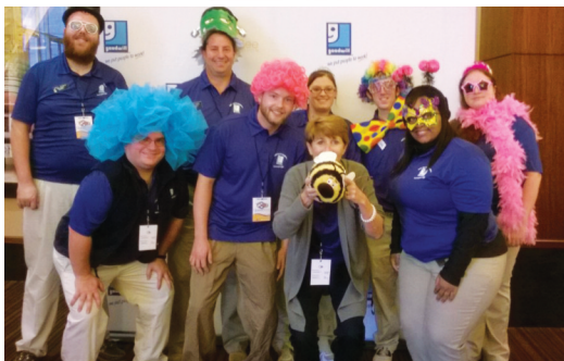
Goodwill Team Members helping at Inaugural Queen Bee Half Marathon!