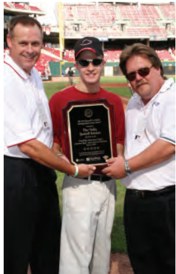
Disability Awareness Night at Red's Game July 22, 2006

Ohio Valley Goodwill thanks MassMutual Insurance, Exceptional Parent magazine, and the Cincinnati Reds for their support of people with disabilities.